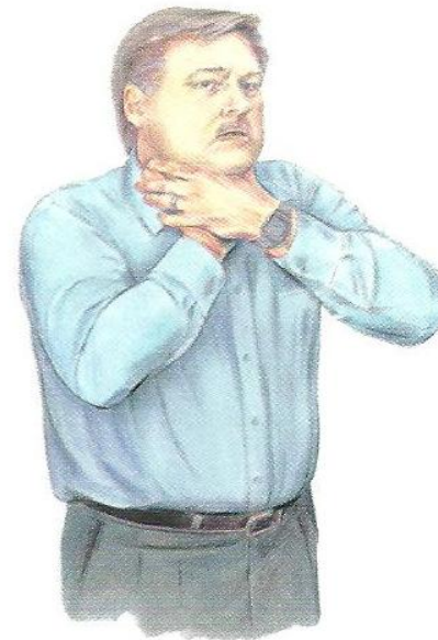
Figure 14. The choking sign. The victim holds his neck with one or both hands.

If someone is choking, he might use the choking sign (holding the neck with one or both hands) (Figure 14).